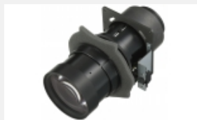
VPLL-Z1024 Projection Lens for the VPL-F Series