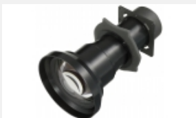
VPLL-1008 Projection Lens for the VPL-F Series