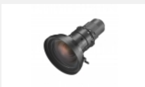
VPLL-2007 Projection Lens for the VPL-F Series