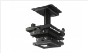
PSS-650 Projector Ceiling Bracket for Installation