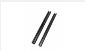
PSS-650P Projector Ceiling Bracket for Installation